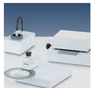
Punched parts SST and ring core sensor