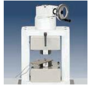
Electromagnet with heating pole

Punched part sensor for destruction-free testing of punched parts in all geometries, e.g. when testing punched parts for motors. Ring core testing module for testing the magnetic properties of ring cores, stators or transformers directly on the component under manufacturing conditions.