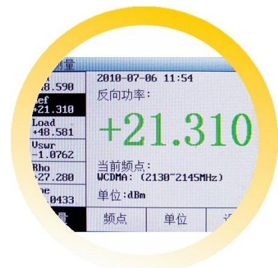
Reflected Power Measurement