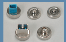
For optical power meters