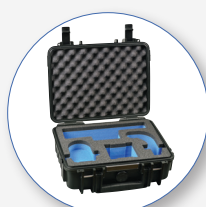
SA 147 Waterproof Carrying Case