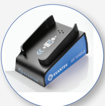
SB 104B-1 Docking Station for Single Dosimeter