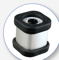
SV 34A Class 2 Acoustic Calibrator