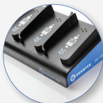
SB 104B-5 Docking Station for 5 Dosimeters