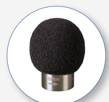
SA 122A Spare Windscreen