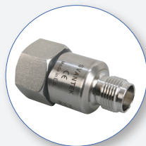
SV 81 Vibration Accelerometer 500 mV/g