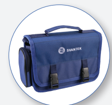
SA 47 Fabric Carrying Bag