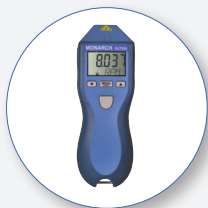
SV RPM_PROB Laser Tachometer