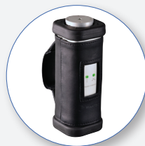
SV 110 Hand-held Vibration Calibrator