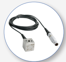
SV 151 Tri-Axial SEAT Vibration Accelerometer