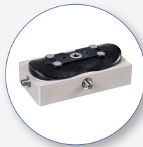
SA 105 Calibration Adapter to SV105 and SV105F