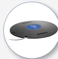
SV 38V Whole-Body Vibration Accelerometer