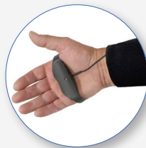
SV 105F Tri-Axial Hand-Arm Vibration Accelerometer with Force Detection