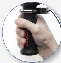
SV 150 Tri-Axial Hand-Arm Vibration Accelerometer