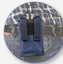
SA 89 Belt Bag for SV 106A