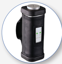
SV 110 Hand-Arm Vibration Calibrator