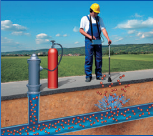
Tracer gas measurement