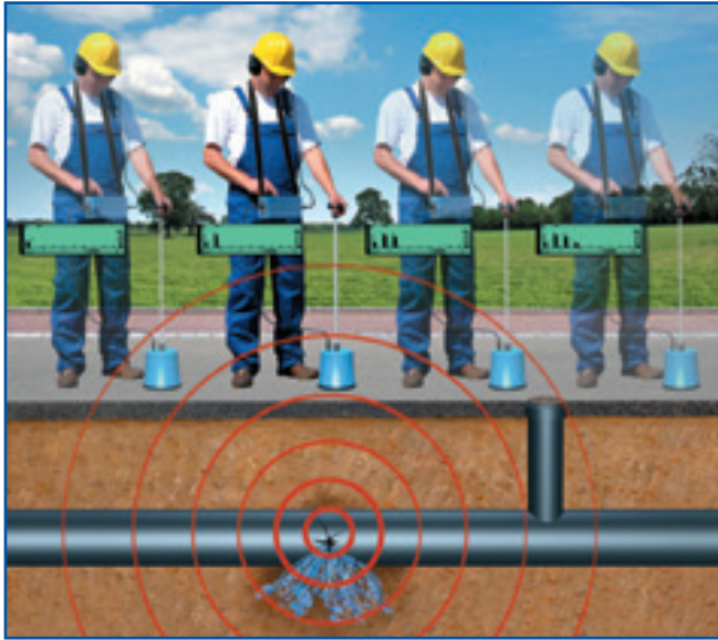
Procedure of leak locating