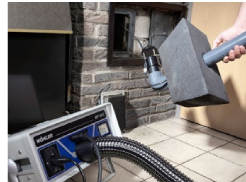
Ensuring safety and meeting standards: Testing a type N chimney under negative pressure conditions at either 20 Pa or 40 Pa.