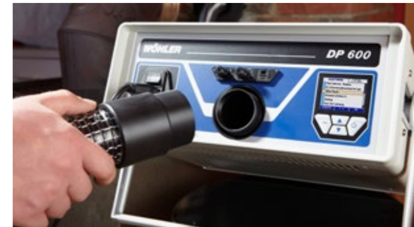
Setting up for measurement is easy: Just connect the pressure and air hose, input three values, and you're good to go!