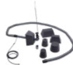
Sealing Set Type „N“