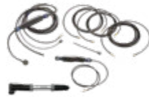
Sealing Set Compact for P/M/H Test