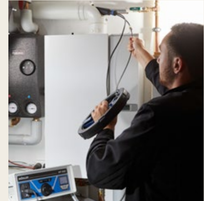
Leakage test of the flue gas system: In preparation for the test, the flue gas pipe is sealed at the top and bottom with sealing bladders. This is very simple, as the bladders can be easily pushed through the pipe from below using a reel and then position them.