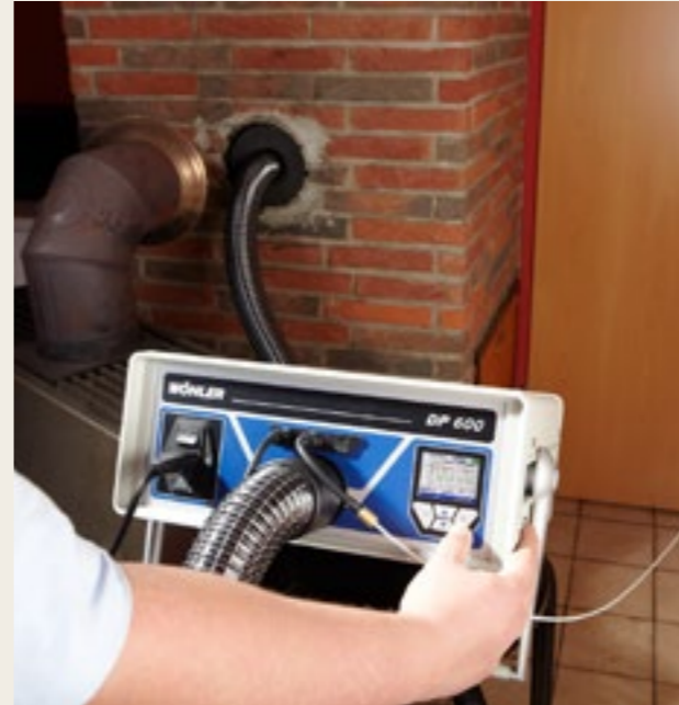
The 4 Pa Test can be carried out in a detailed procedure to prove that there is sufficient combustion air. The Wöhler DP 600 guides you safely through the measurement menu.