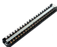
Terminal Block 20P