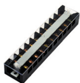
Terminal Block 10P