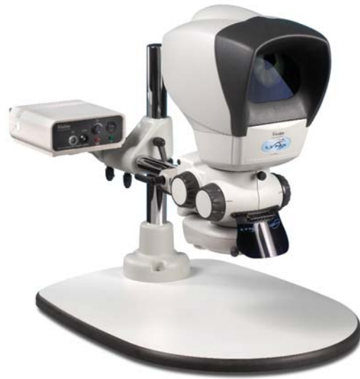
Lynx, with swing away boom mount, for flexibility and ease of use.

Lynx is used in a wide range of industry applications including general manufacturing, medical devices, electronics, precision engineering, plastics and rubber. The multiple accessories available for the Lynx enable a wide variety of tasks including inspection, manipulation, assembly, dissection, soldering, polishing, finishing and measurement.