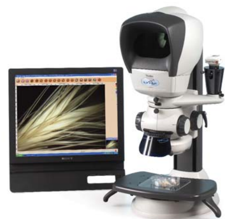
Lynx bench stand with optional image capture accessory and floating stage