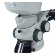
Fixed angle viewer