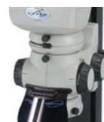
Step magnification multiplier