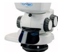
Oblique and direct viewer