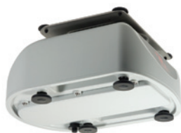
BW Series - Bottom View