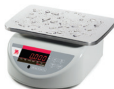
BW Series - Large Pan Accessory