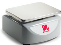
BW Series - Rear View