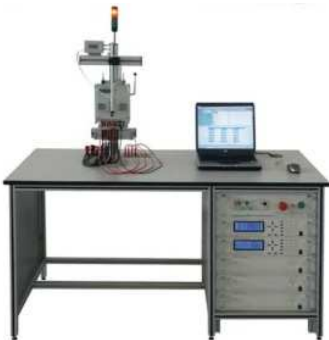
Electricity Meter Test Equipment 8301 with single position